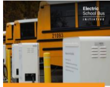
Electric Vehicle (EV) Make-Ready Programs Considerations for Utility Regulators for Electric School Buses and Beyond