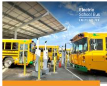
Power Planner for Electric School Bus Deployment Nine Key Steps for School Districts